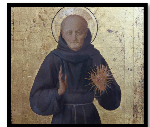
St. Bernadine of Siena

(Excerpt of sermon by St. Bernadine of Siena)