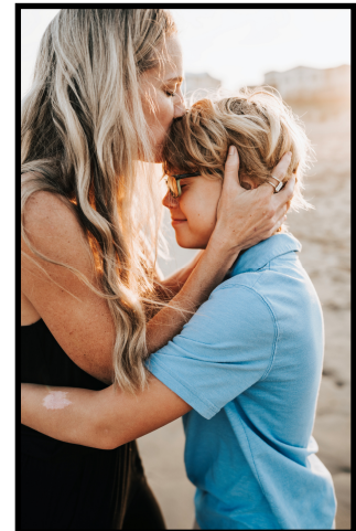
Taken Nov. 6, 2023