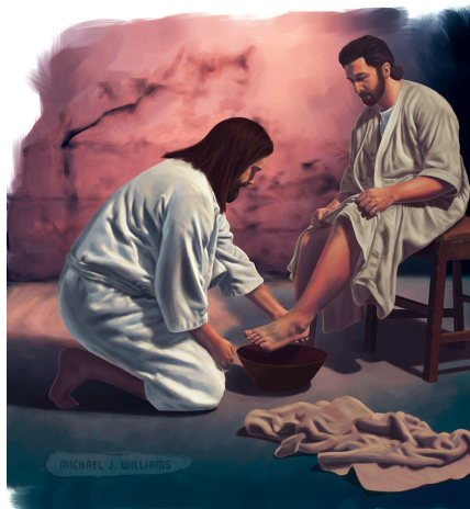
Cover illustration for the book "The Imitation of Christ" by Thomas A Kempis

Our journey, as Christians, to learn and imitate Christ, starts with prayer. Having a conversation with God as your best friend you will know how much He loves you and that He wants what is best for you. You can tell Him anything. He will show you how precious you are and you will be filled with His intimate love. You will grow stronger in faith and knowledge. You will learn His truth and become disciples for others. Let us continue to be Christ's students and we will be those disciples that will build up the Church.