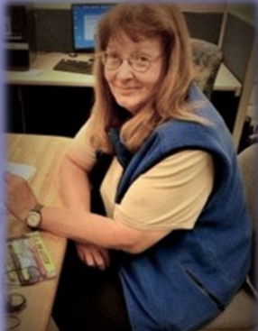
March 1960 - May 2023